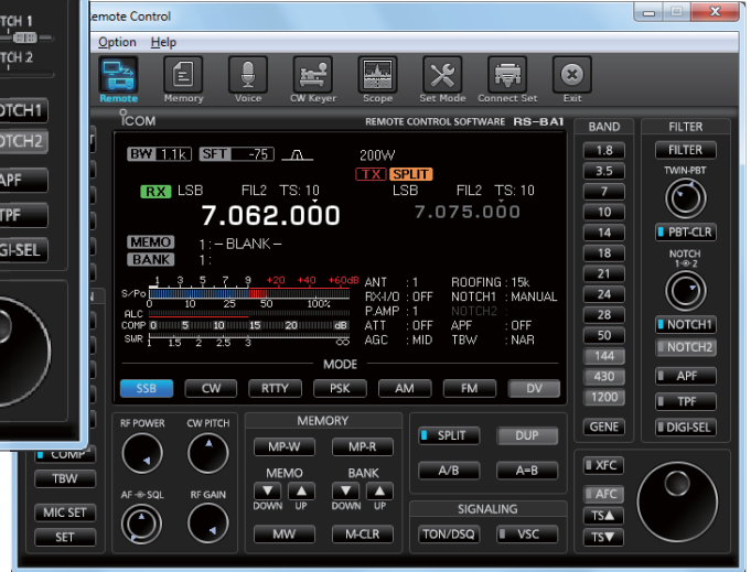
● Tuning knob controls