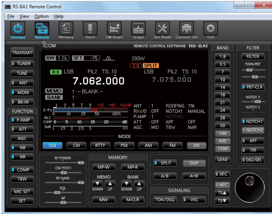
● Slider Controls