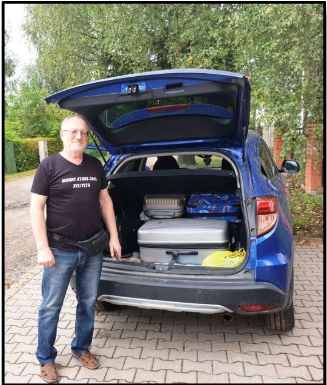
Yuris YL2GM starting expedition journey

First task after receiving license was to book flight tickets for the team. Europe's large airline companies recently have downsized baggage limitations per passenger and for every additional weight unit they charge extra and this increases expeditions expenses significantly. To Brisbane in Australia I chose Etihad airlines and continued by Nauru airlines to Nauru with connection flights in middle. To both companies I submitted expedition support applications for sponsorship of additional 50 kg baggage. Nauru airlines decision to support us was positive, but Etihad airways declined. So, from Riga to Brisbane we had to pay extra for our baggage to both ways which in the end sums up more than one additional passenger ticket.