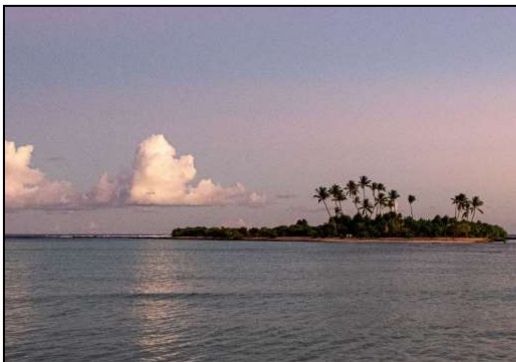
View from our island