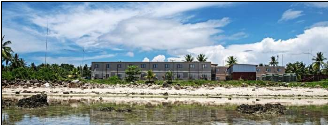
C21WW QTH and antennas