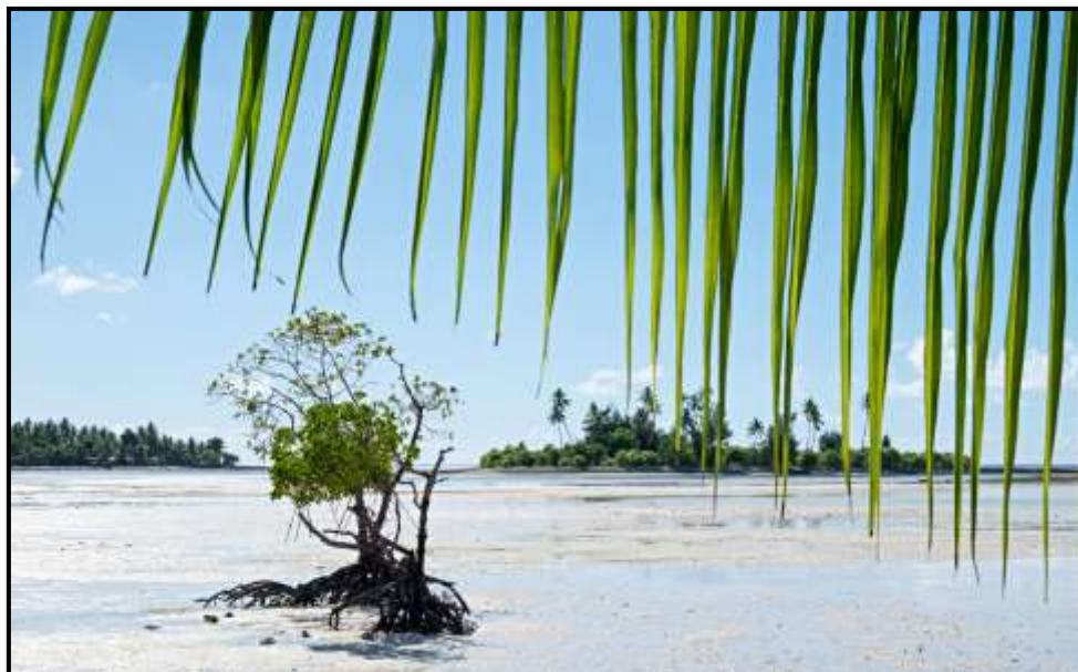
View from our island