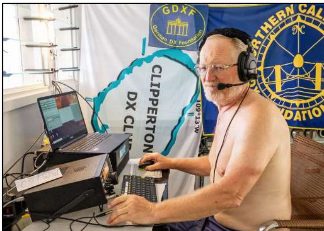
Yuris YL2GM operating

Today I received message from Nauru Airlines about changes in our flight schedule – our flight for 25 th of September from Nauru to Brisbane is cancelled and we are offered to take this flight one day earlier. This changes our plans because we will operate one day less and we will have to spend additional night in Brisbane.