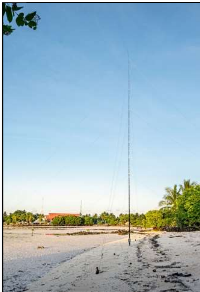
160/80/60/40/30m RA6LBS 18m high vertical

Propagation does not improve. On higher bands 24 and 28 Mc there is only noise and we cannot do a single QSO. Some progress on 18 Mc where we are able to make