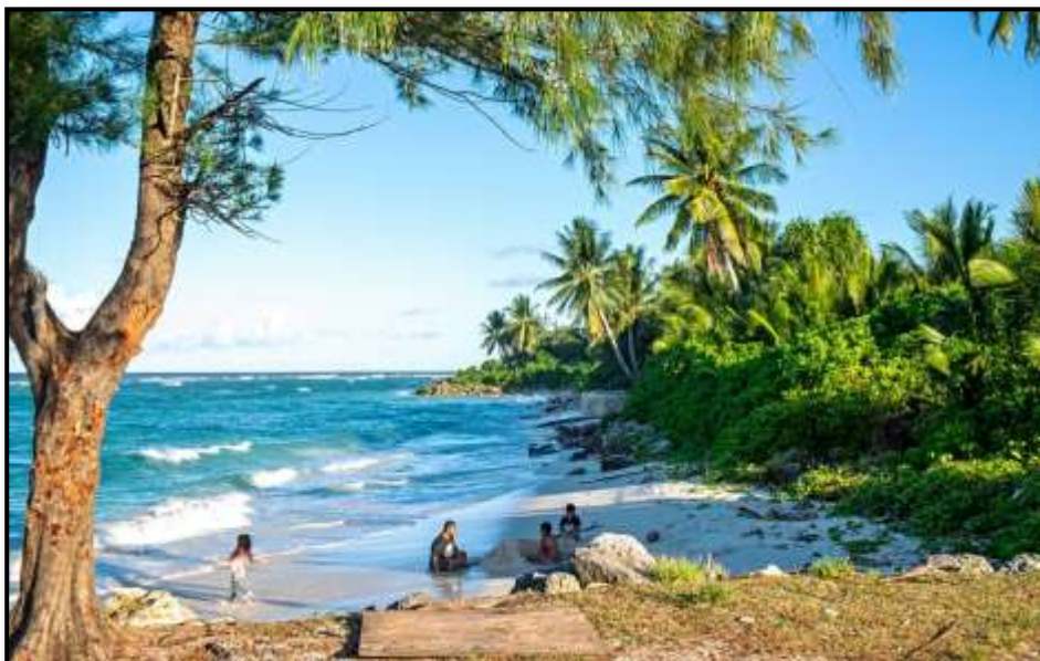
One of many very beautiful sights on the island

Before our flights home we go for a quick sightseeing tour on the island. We visit main port and phosphate mines and after sending postcards home from local post office we catch our plane for Brisbane. There we land around 7 pm. Baggage formalities go by fast and it is delivered to our hotel next morning.