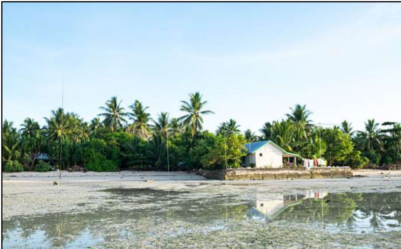
T30L QTH – Dreamers guest house

this ground. We fixed this by finding 1m long wood poles on the site that we hammered in the sands and covered with stones. After midday we finished this vertical montage and felt that we had burned in the hot sun so the remaining antenna installing had to be postponed to early morning when it's a bit chillier. Kaspars is operating and we don't bother him with these works.