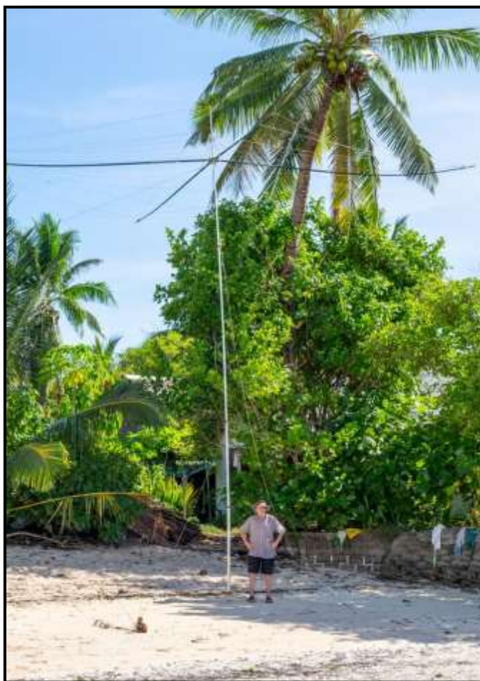
Jack YL2KA and 20/10m Spider-beam

After sending logs we see that we have crossed our 10 000 QSO mark and again the statistics with Europe has improved to 9.8% of total QSOs. We also manage to make our first QSOs on 10 and 12m, mainly with Japan. As this expedition phase approaches its end, we have to start thinking about dismantling antennas and packing for Nauru.