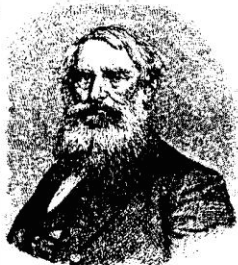
Samuel F.B. Morse 1791-1872

For news of what's happening in the World of Morse, read "MM"! This unique bi-monthly magazine carries a wide range of articles on all aspects of Morse, past, present and future. If you like Morse, You'll like MM!